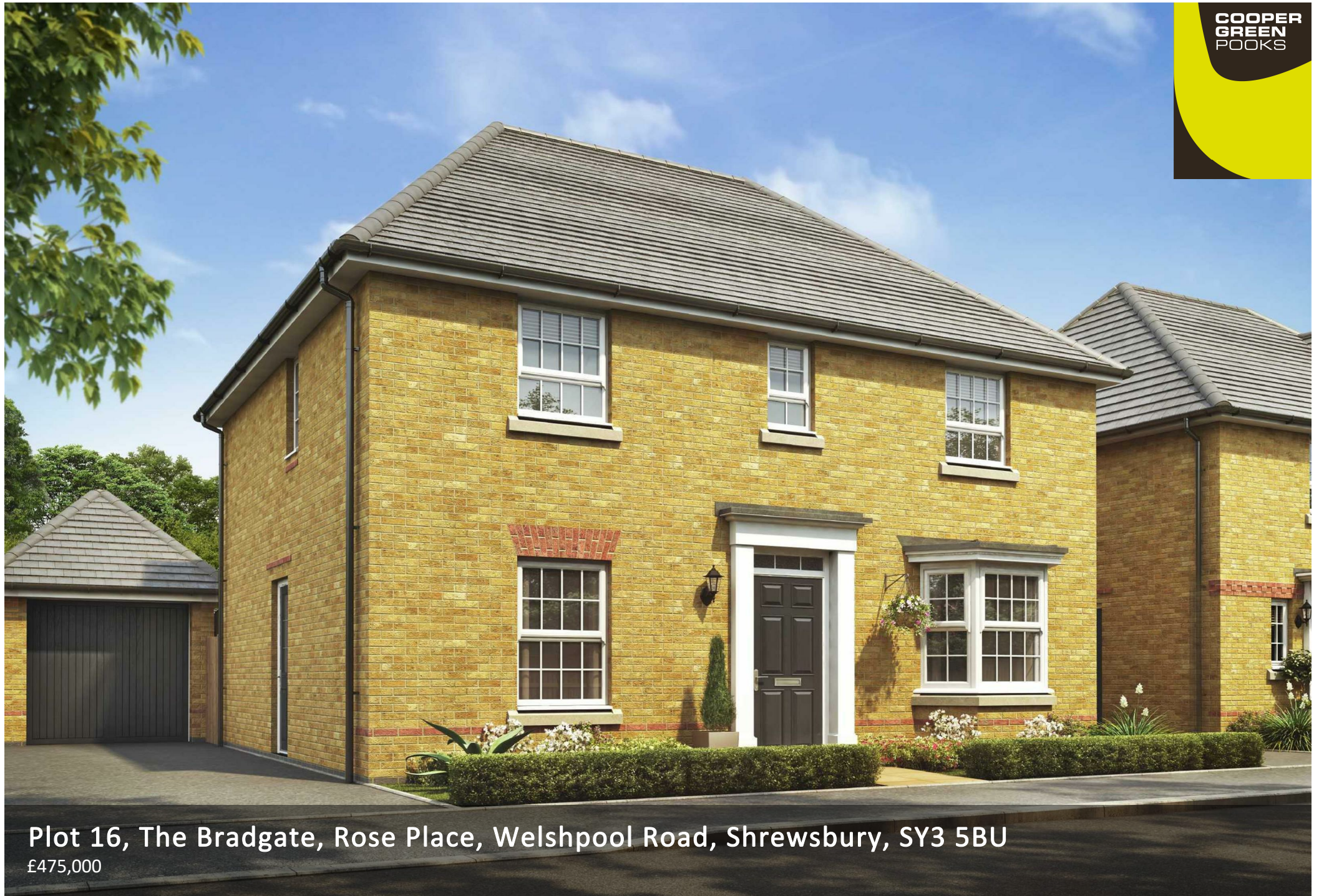
Plot 16, The Bradgate, Rose Place, Welshpool Road, Shrewsbury, SY3 5BU £475,000